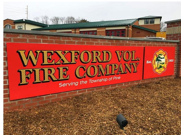
Wexford Fire Department - Sign Panels

We have been working closely with client Chapman Westport to map out various signs in this emerging business park near the Pittsburgh International Airport. In this case, we designed, fabricated and installed 9" tall laser-cut acrylic letters branding the park and identifying its most important road intersection. Look for more of our work at the business park in coming months.