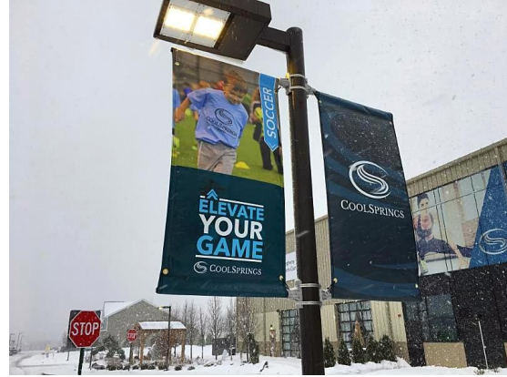
Cool Springs Sports Complex - Pole Banners

NexTier Bank needed to add marketing punch and update its logo on two of its retail offices. We obliged by fabricating and installing three illuminated channel letter signs, complete with 'raceways' so they could be cleanly attached to the buildings. Each raceway is nearly 20 feet long, with 25" tall letters.