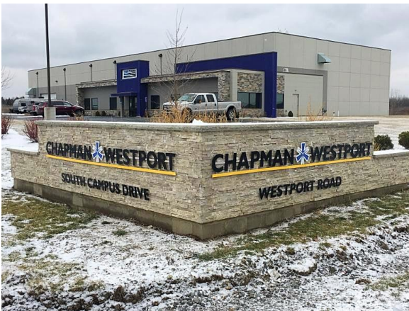
Chapman Westport - Directional Signage

Cool Springs Sports Complex wanted to highlight the many sports one can play at its facility. Spark jumped in by producing 36 vinyl banners with graphics that represented 9 different sports, as well as Cool Springs' on-site restaurant. We also utilized pole hardware to make the installation simple and look great.