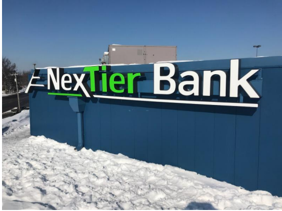
NexTier Bank - Illuminated Channel Letters

NexTier Bank needed to add marketing punch and update its logo on two of its retail offices. We obliged by fabricating and installing three illuminated channel letter signs, complete with 'raceways' so they could be cleanly attached to the buildings. Each raceway is nearly 20 feet long, with 25" tall letters.